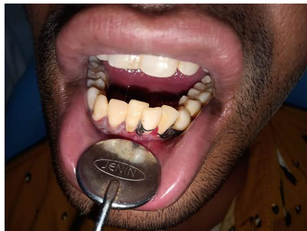
Fig. 1: Photograph showing sutures with lower anterior teeth region

revealed healing of bone in the anterior mandibular region (Fig. 8).