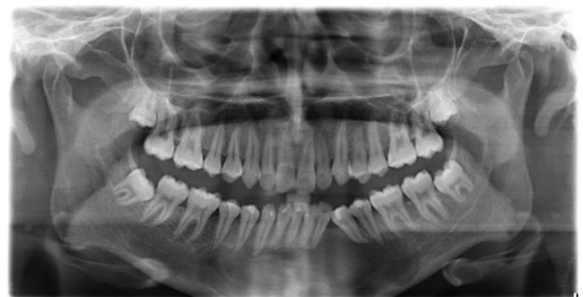
Fig. 8: Post operative photograph showing healing of bone in the anterior region of mandible