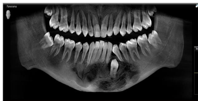
Fig. 3: CBCT imaging showing panoramic view. Unilocular radiolucency seen extending from 36 to 46 along with impacted 33