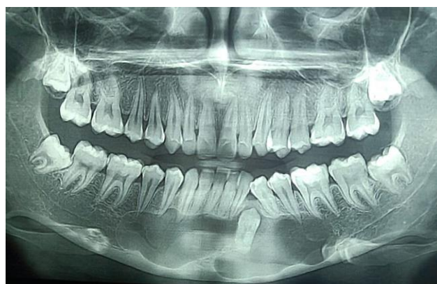
Fig. 2: Orthopantomogram showing a unilocular radiolucency in the mandibular anterior region extending from 36 to 46