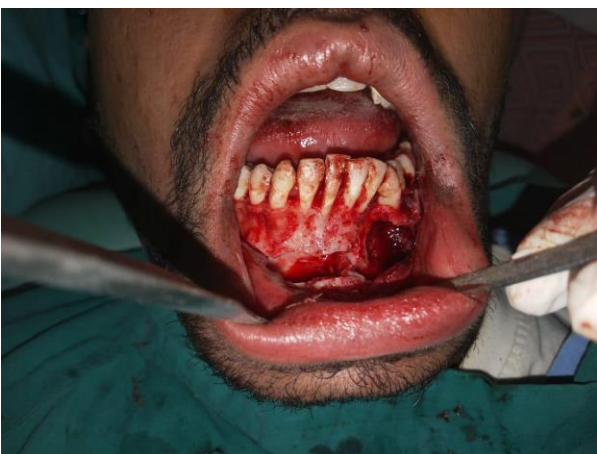
Fig. 6: Photograph showing decortication of the lesion using Carnoy's solution