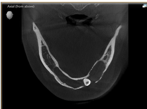
Fig. 5: Axial view on CBCT showing thinning of cortical plates and resorption of buccal cortical plate in 33 region